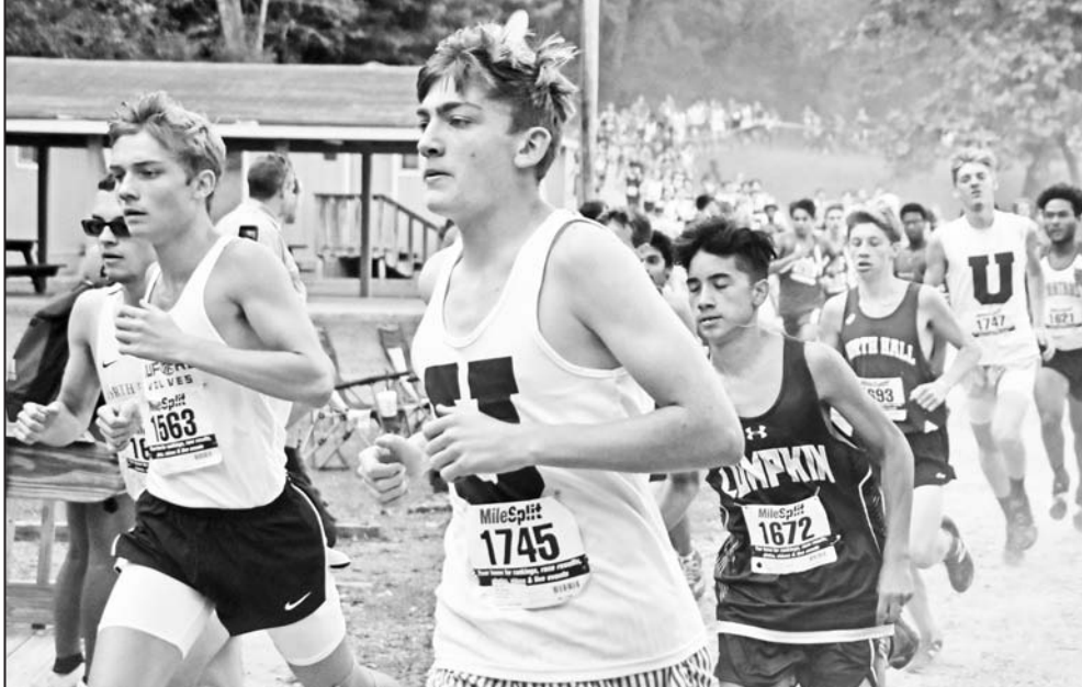
Union County Cross Country in action earlier this month at Unicoi State Park - the same location as next week's region meet.