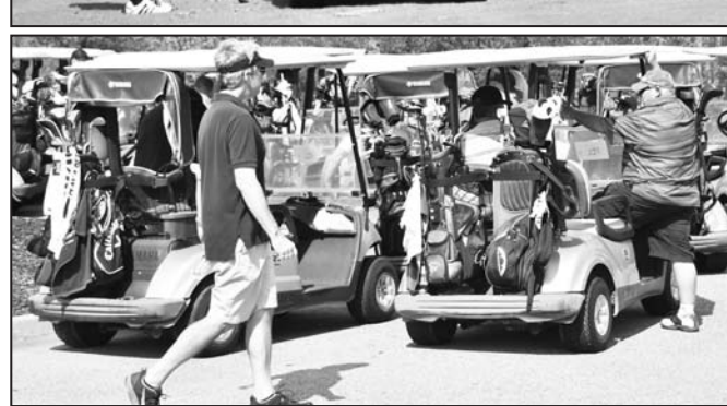
Rotary Club Tournament